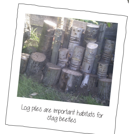
Log piles are important habitats for stag beetles

For more information on planning and development, the legal requirements and what your role is, please visit our website www.ptes.org/stagbeetle