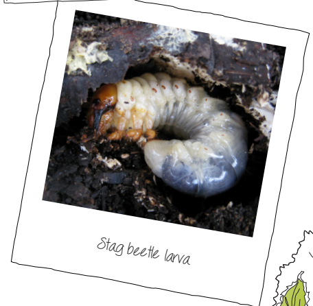
Stag beetle larva