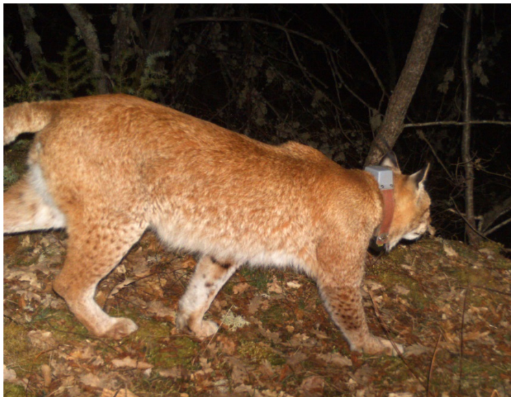
Martin the lynx

You can find out more about the Macedonian Ecological Society's work and the Balkan lynx at their website: http://www.catsg.org/balkanlynx