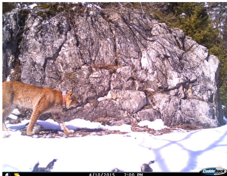
Martin the lynx