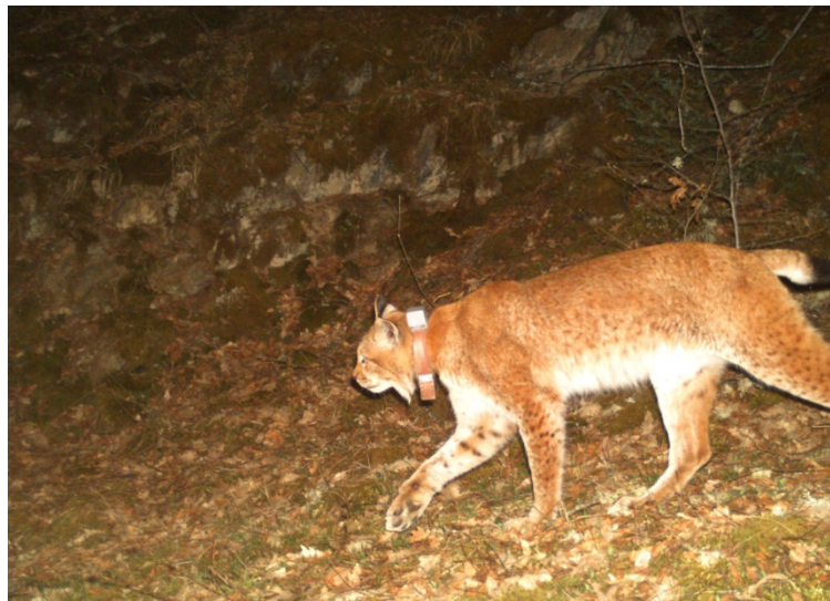
Martin the lynx

PTES provided funds in 2013 to the Macedonian Ecological Society, to study the endangered Balkan lynx. In spring this year they put one of the radio collars, bought with our funds, on a male called Martin. Since then he's roamed over 400km 2 in the western parts of Macedonia. His territory is huge, and will likely overlap the territories of two or three females. In Norway, where the density of lynx is even lower, the males can have territories of up to 2,000km 2 . The team hopes to collar a female in the area later in the year to see how the two interact – we will keep you updated.