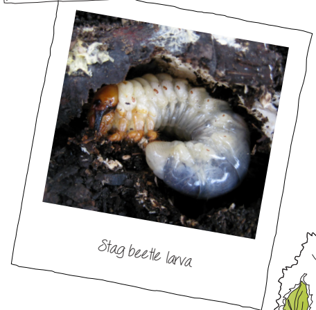
Stag beetle larva