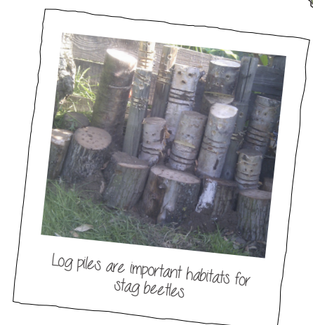
Log piles are important habitats for stag beetles

For more information on planning and development, the legal requirements and what your role is, please visit our www.ptes.org/stagbeetle