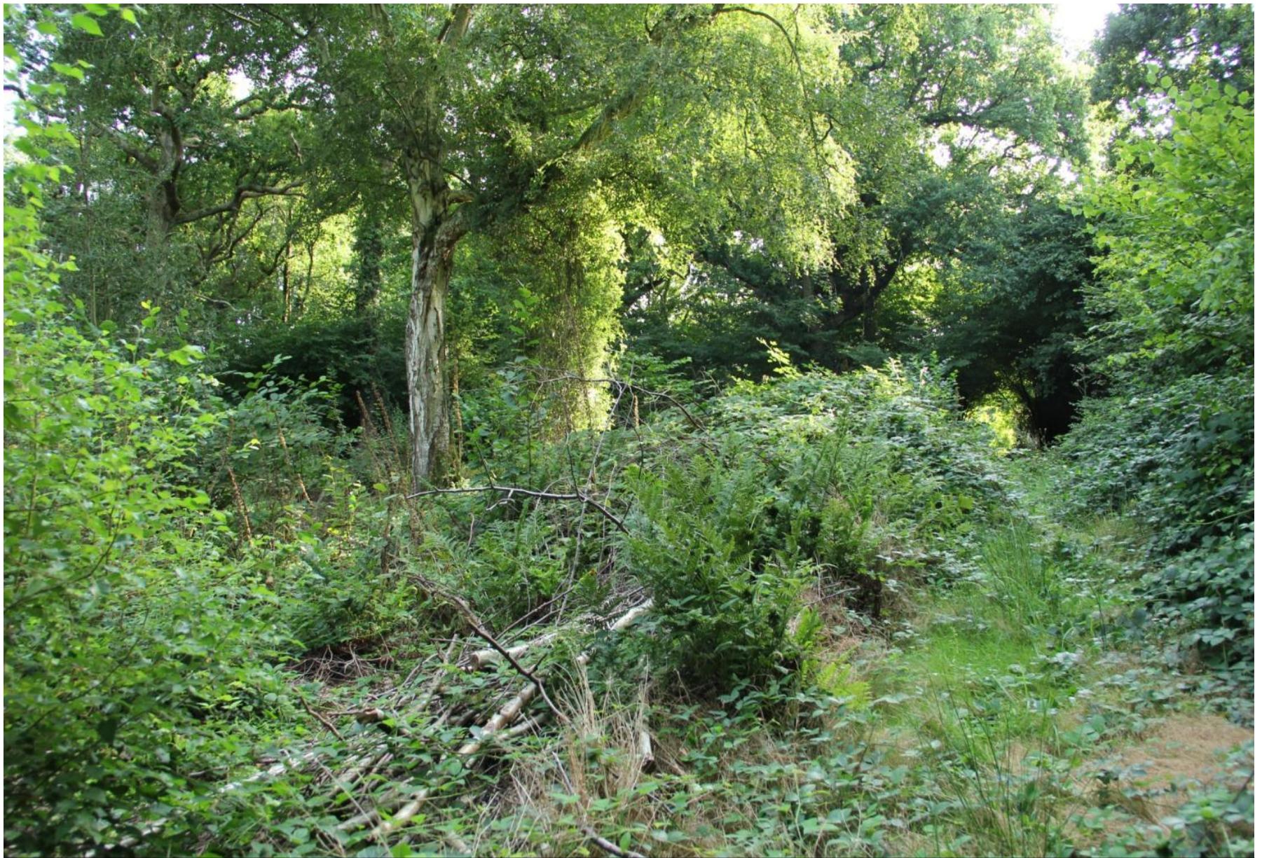
This coppice coupe has been surrounded by a crude dead hedge to utilise the material cut.