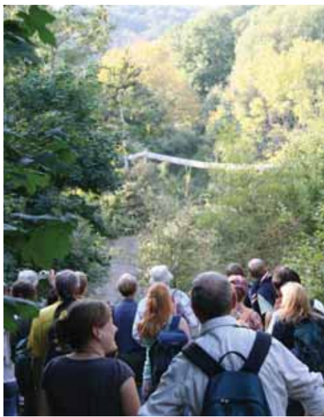
Delegates were shown the first wire bridge in use in the UK during their field trip through Cheddar Gorge.