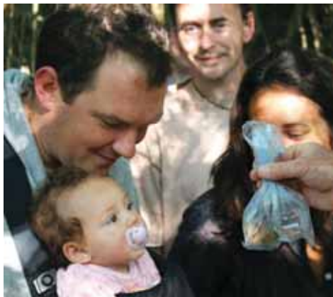
A PIT-tagged dormouse was on hand for participants to see.