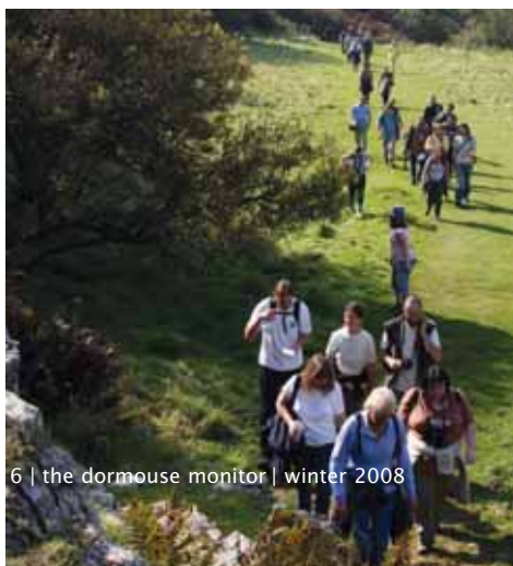
The nine mile walk on Sunday's field trip took in Black Rock where the first monitoring of the NDMP scheme was undertaken.